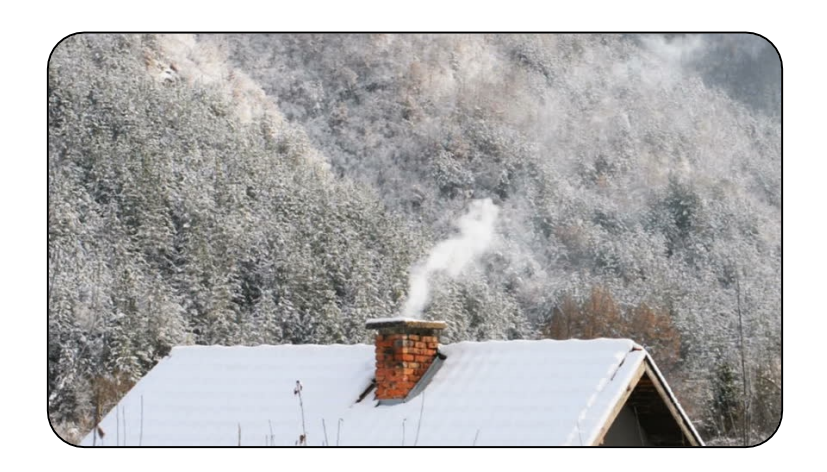
Minimising energy cost

Lack of Energy- and People-Efficient Management of Buildings