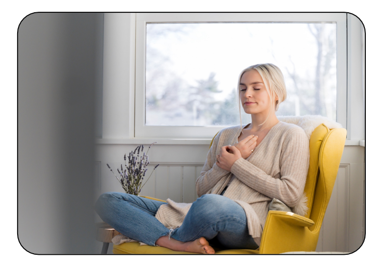
Maximising user well-being

16 % of world energy consumption is wasted because of inefficient energy management in buildings