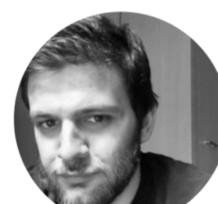
Lasha Cloud Developer