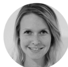
Dita Event Management